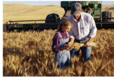
▲ Agricultural & Environmental Protection