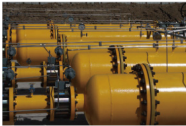
▲ Municipal Engineering & Utilities