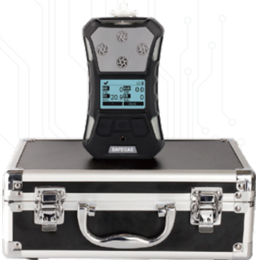
SKY3000 — Portable gas detector

SKY3000 series is a high-performance portable gas detector that can detect multiple gases (Oxygen compounds VOC, combustible gas and toxic gas) at the same time and has man down alarm function. The device has humanized operation functions such as one-key security detection, one-key storage, automatic image flipping, as well as the man down alarm function; With optional Bluetooth transmission function, allowing safety personnel to obtain real-time data and the alarm status. It has obtained international IECEx, ATEX explosion-proof certification and Chinese explosion-proof certification; As it passed the antistatic test, and the protection level reaches IP67; With safer product design and the module design which makes the detection faster, and the compact ergonomic design makes the device easy carrying.