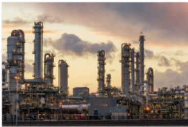
▲ Petrochemical & Chemical Industry