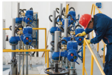
▲ Other Industries