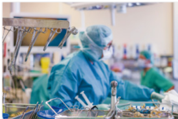
▲ Food & Pharmaceutical Industry